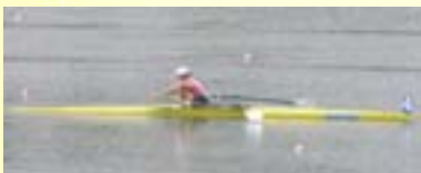
Saxon Ramon Women's U16 Single Scull