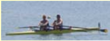
Grafton High - GOLD Schoolboys Double Scull