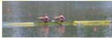
Lower Clarence Rowing Club GOLD - Schoolgirls Double Scull