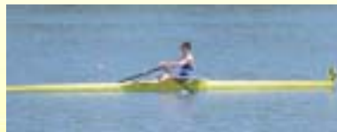
Sam Fortune Men's Lightweight Single Scull